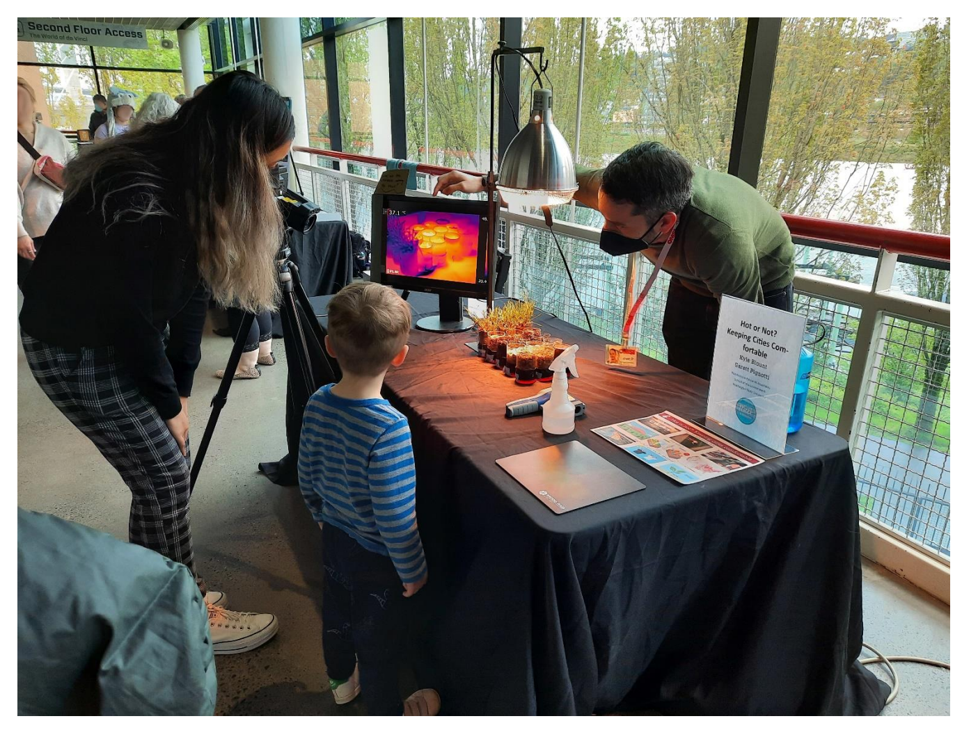
Figure 4. Activity set up and demonstration modified for a general public audience. Presented during the Oregon Museum of Science and Industry (OMSI) "Meet a Scientist" event on 7 May 2022.

Because interest, background knowledge, and contact time highly varied, flexibility in tailoring the public activity to individuals was key. This includes providing an immediately engaging aspect. For young children, we used an inexpensive thermal mousepad that changes color when touched (e.g., https://grifiti.com/products/grifiti-mood-mouse-pad) and largely emphasized interactive and hands-on aspects of the activity, namely the ethanol spray and measuring temperature with the thermal infrared thermometer. This allowed us to discuss basic heat concepts in simple language. For adults, we asked more direct questions to prompt critical thinking about how ET functions to cool the environment. We used sweating in humans as an analogy to better communicate this process. For interested participants, we asked them to extend these concepts further into how urban compositions may amplify heat and the consequent design implications. Including a discussion of personal research