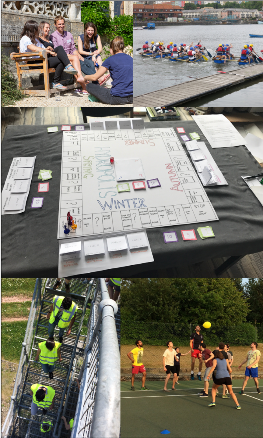
Figure 3: Examples of Summer School Activities (Photo credits: Top left © Tim Gander 2018. Bottom left and right © Lina Stein 2017).