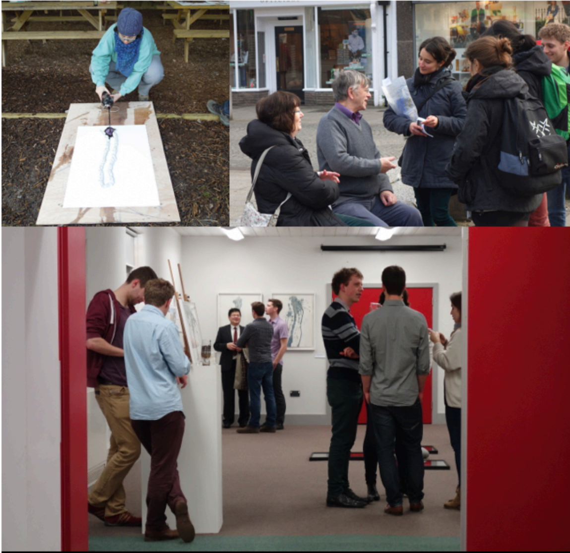
670 Figure 6: The Land of the Summer People art project paired each group of 3 PhD students with an artist. Each group independently developed a piece of art. Pieces included paintings, stone masonry as well as ‘flood survival kits’ to be handed out to the public.