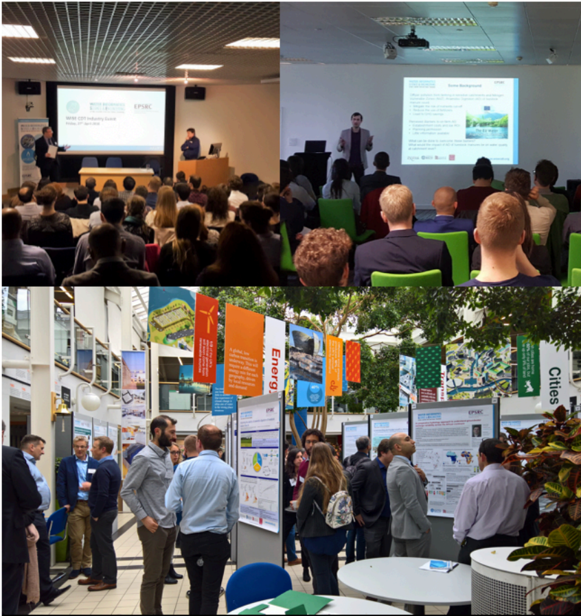
Figure 4: We have run WISE CDT Industry Days with Atkins in 2016, HR Wallingford in 2017, Arup in 2018, and jointly with the Wet Networks event series in 2020. (Photo credits: © Tom Arnot).