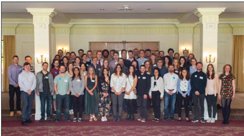
Figure 2: WISE CDT PhD Students (Summer School in Torquay, UK, 2019, Photo credit © Steven Haywood 2019)