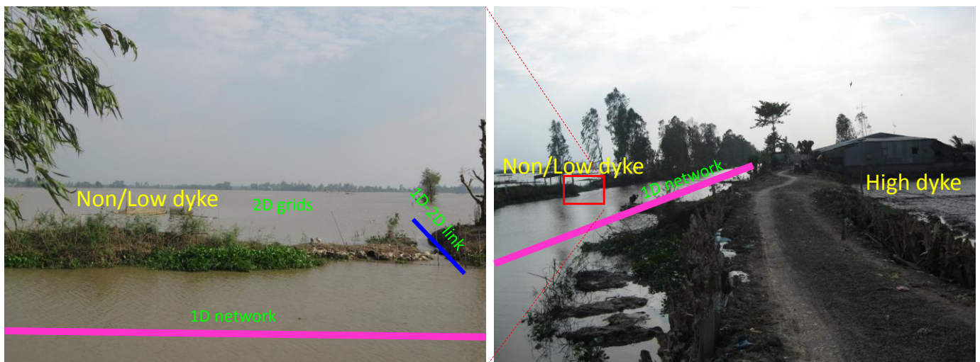
Figure 2. A high dyke and non/low dyke in An Giang province and their schematization in modelling.

- Following all the hydrological details reported in the manuscript is sometimes difficult. Please always remind that a reader might not be familiar with the cited locations. All the cited locations should be identified within a Figure. For example, I would recommend adding a figure explaining the different geometric configurations and the dyke systems considered in the different cases. For example, what are the dyke system considered for the configuration LXQ, PoR, etc.?