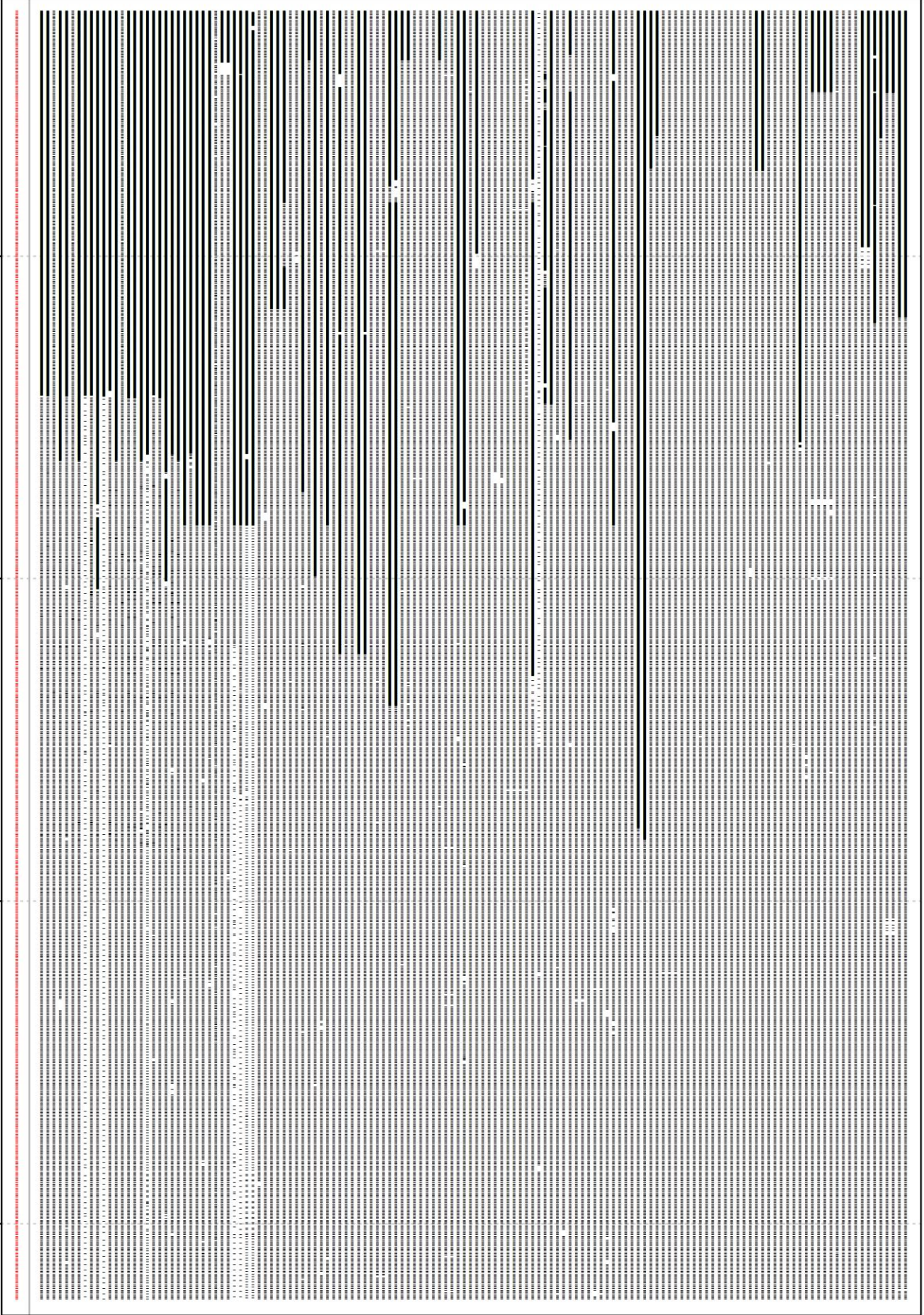
Figure S1 Dates of reading of groundwater head of the selection of the 141 groundwater head series before interpolation. The red dates left of the solid grey line show the quasi-weekly measurement dates which are used for the groundwater head series after linear interpolation.