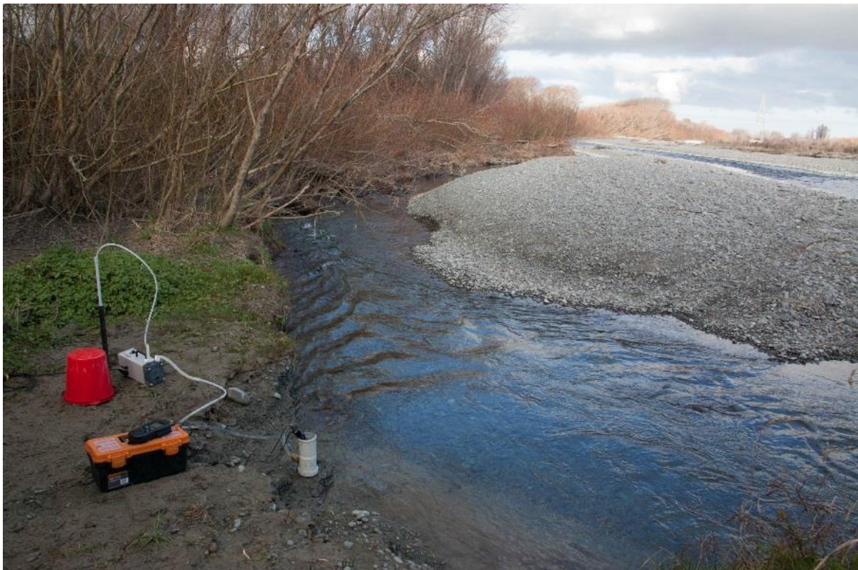
Figure 5. Mini-piezometer installed on the bank of a braided river (Coluccio, 2018).

Previous studies have examined the correlations between groundwater levels and river levels to establish the degree of connectedness of groundwater systems and braided rivers, for example, attempting to identify the causes of drying reaches and changes in long-term river flows. Prior studies have been carried out in catchments with substantial agricultural surface and/or groundwater abstraction for irrigation. Thus, the questions here are often whether abstraction has caused drying in rivers or decreases in river flows, and what effect future