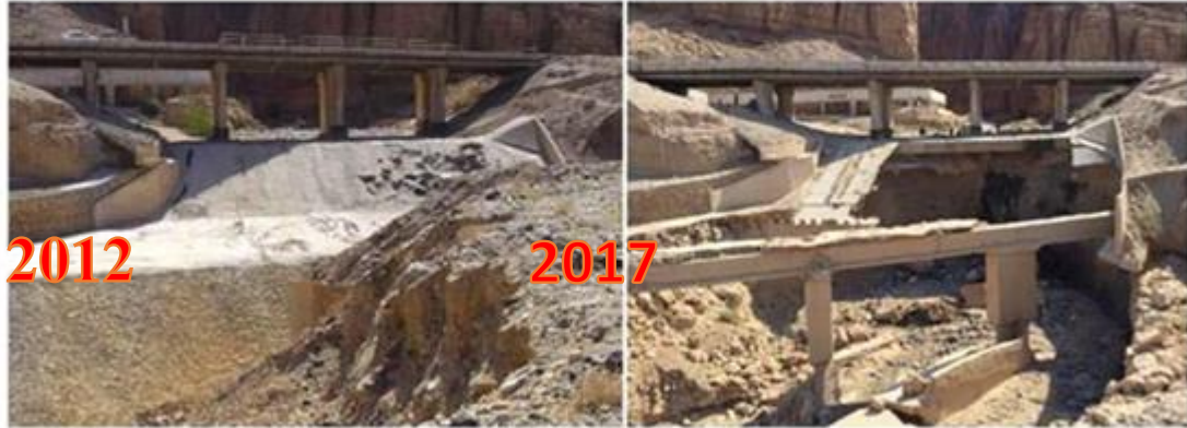
Figure 9: Example of a bridge along the Dead Sea motorway damaged by progressive erosion of the sediments. Similarly to Figure 8 A-B, all bridges along the coast are affected by the rapid incision of the river bed. Each year, the available energy released during erosion process is more important (square function)