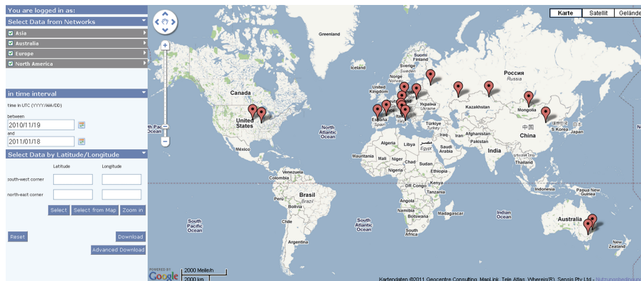
Fig. 2. Web interface of ISMN. Red droplets indicate the center coordinates of the different networks contained in the database.