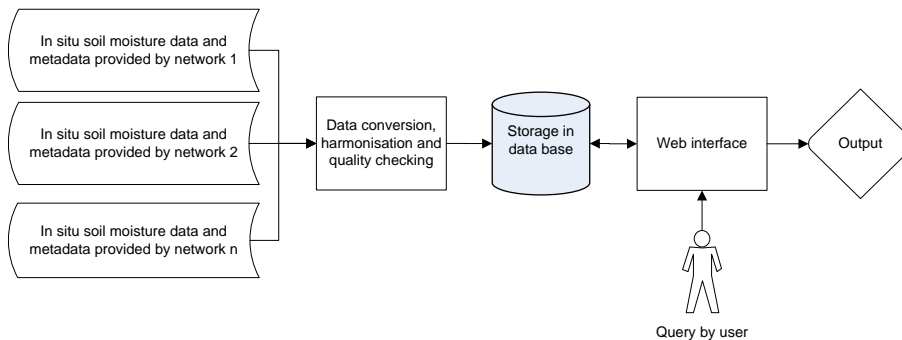
Fig. 1. Conceptual overview of ISMN.