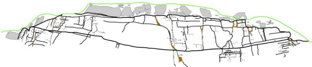
Figure 1 a profile of fracture distribution at DJS in Chenqi catchment

A larger infiltration capacity due to the larger fractures in the upper layer than in the lower layer usually results in that rainwater is retained near the base of the epikarst leading to the formation of an aquifer during heavy rainfall events.