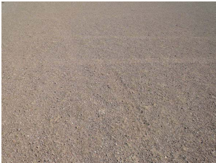
(SQH landscape picture, taken by Mr. Chen Xuelong on May 24, 2008)