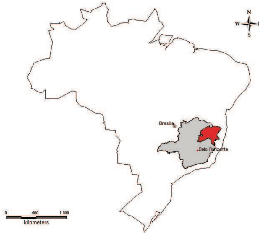
Fig. 1. Map of Brazil showing the project's region within the State of Minas Gerais. The project area is coloured in red.