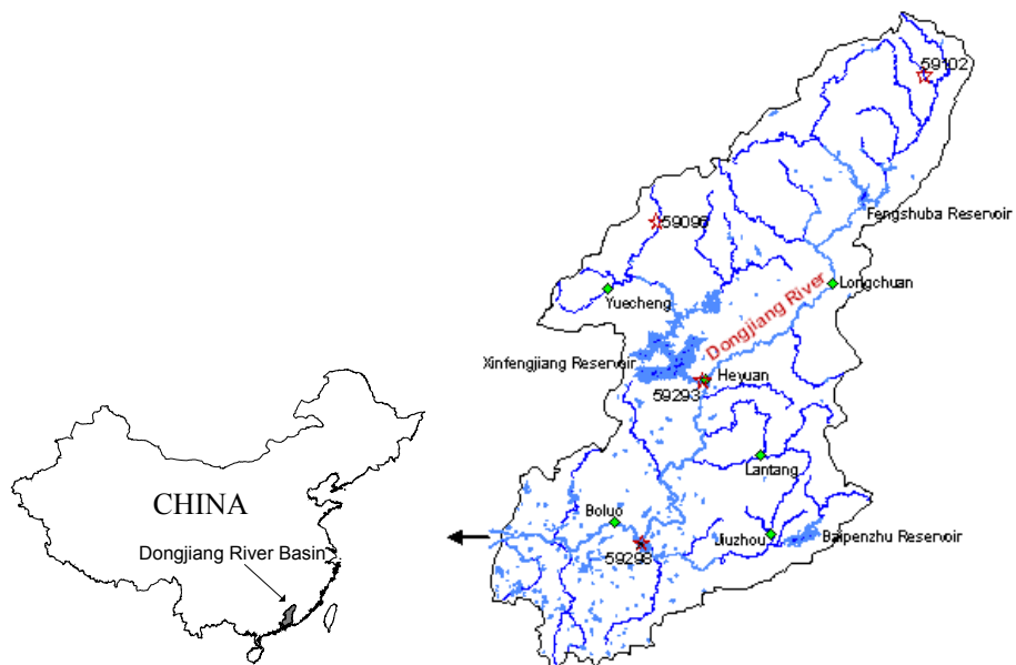
Fig. 1. Location of the study area (left) and locations of gauging stations (right).