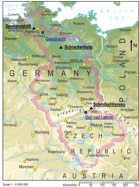
Fig. 2. Elbe river basin with main gauging stations (triangles) and fish passes (squares) (based on http://www.grid.unep.ch/product/publication/freshwater_europe/images/map9.jpg (24 April 2007)).