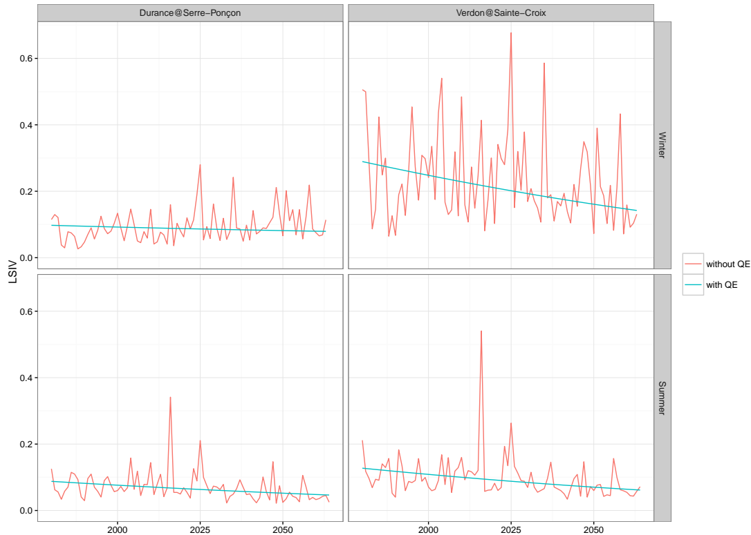
Fig. 2. Temporal evolution of LSIV with and without the quasi-ergodic (QE) assumption.