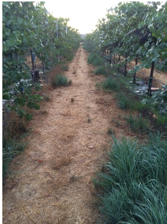
Fig. 1. FigureR1_InterrowExample