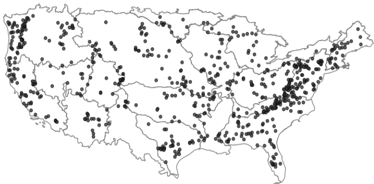
a) HCDN basin locations