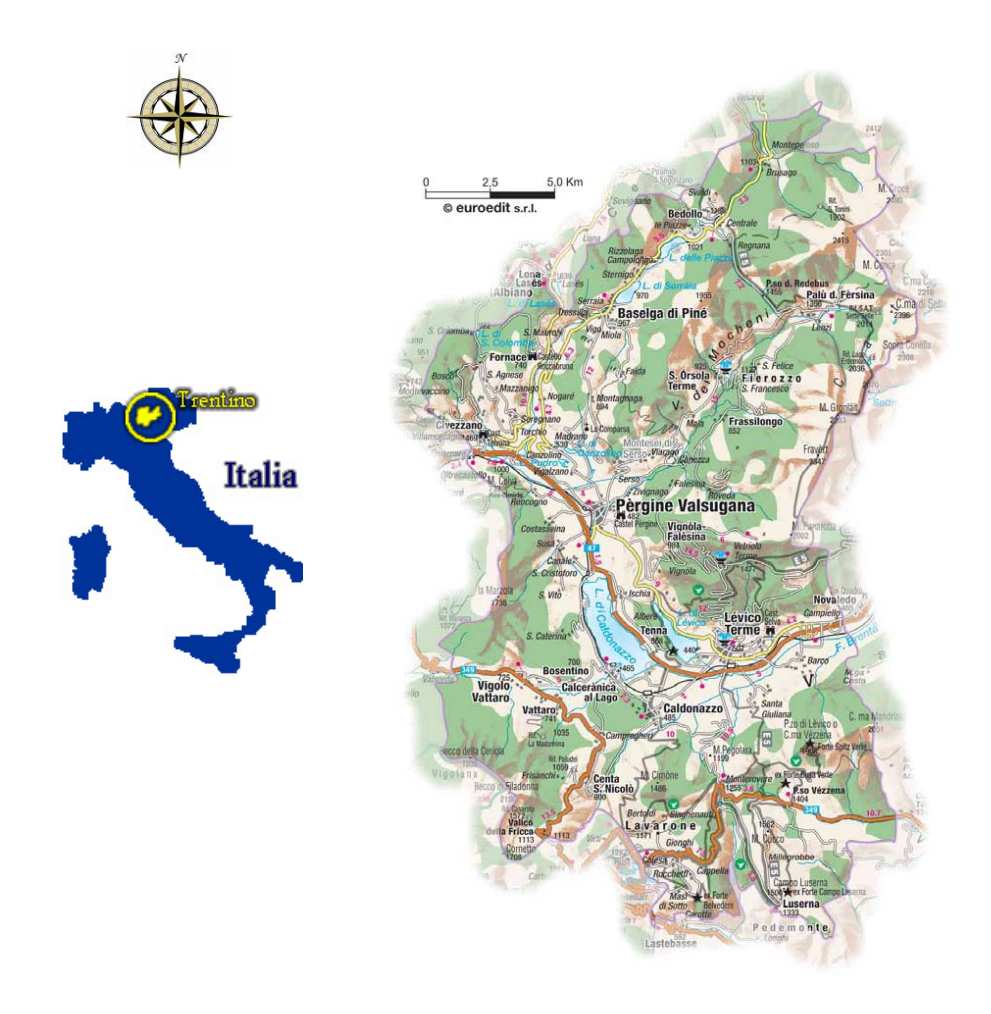
Fig. 1. Map of Trentino, a northern Italian province and of Alta Valsugana, an alpine valley of Trentino.

resorts and a few small ski resorts in the mountains that surround the valley. However, tourism is mostly concentrated to the summer season. The Alta Valsugana is also an important route of communication as it connects Trento (the main city of the region) with Padova, Venice and other important cities of the Veneto Region. Transport occurs on a highly trafficked motorway and a railway which both follow the Brenta River, the main tributary that runs through the Alta Valsugana. In addition, there are also a few small hydro power plants operating in the valley.